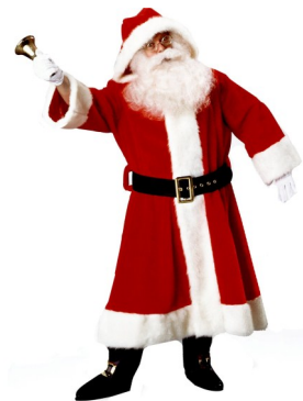
An incredibly jolly guy

Christmas is fast approaching and the busiest part of the year is upon us. Its not too early to reserve a table for your workplace dinners, club breakups or family get-togethers. We welcome all booking sizes, great or small. Please call us on 8381 1744 or reserve online and enjoy the festive season with us.