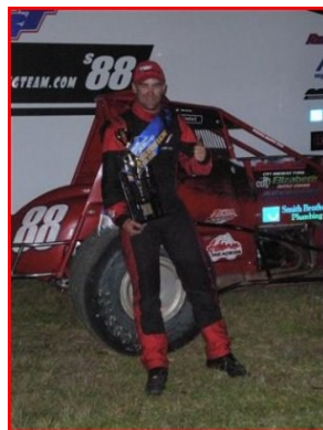
An incredibly fast guy